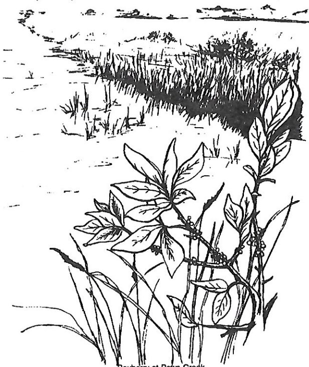
Bayberry at Pews Creek

The Ice Age was global, locking vast quantities of water within the continental ice sheets and causing a reduction in size of the Earth's oceans. The size reduction caused the oceans to retreat from their current shorelines to a lower elevation which corresponded with the continental shelves. The Atlantic Ocean during the Ice Age had its shoreline 100 miles east of New Jersey at the continental shelf margin. At that time streams and rivers fed by glacial meltwaters and precipitation flowed across the exposed continental shelf and discharged